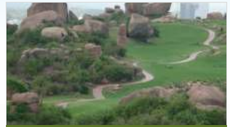
Boulder Hills Golf Club