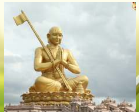
Statue of Equality