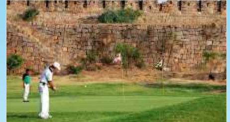
Hyderabad Golf Association (HGA)