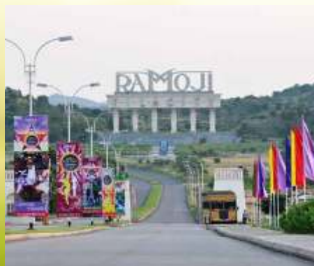
Ramoji Film City