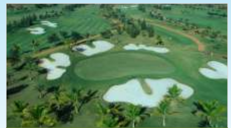
Vooty Golf County

https://www.safgrhyd2022.com/Home/HotelBooking